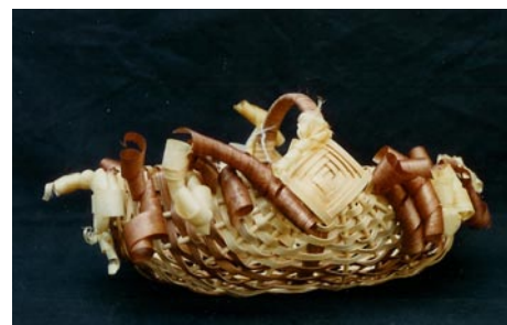
Work by Dorinda Harmon

American Craft Week is an opportunity to celebrate the wonders of American craft. Every day thousands of American artists share their vision and talent by producing amazing hand-made decorative and functional objects. And every day thousands of craft retailers share their love of these items by displaying, promoting and selling them. As one craft artist put it, “this is the creative economy!”