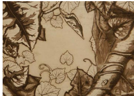
Work by Tammy Oswald, detail

Works in both exhibitions are a testament to Nevitt's dedication to teaching and