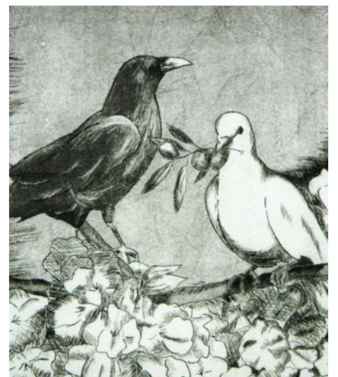
Work by Faith Adedokun

The retrospective features works done in a variety of printmaking techniques, styles, and concepts - from intaglios and silkscreens to collagraphs and monotypes, each decade is marked by its own unique style indicative and reflective of both the student's cultural era and Nevitt's own