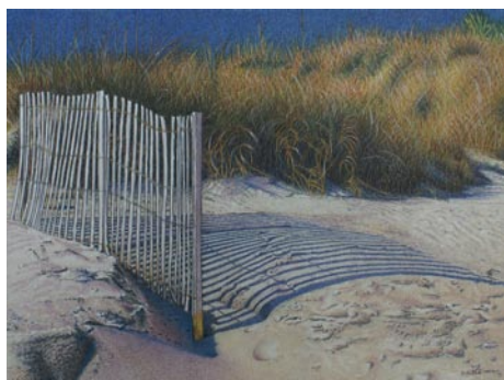
Work by Donna Slade

Colored pencil is a relatively new fine art medium, when compared with oils, watercolors, etc. The Colored Pencil Society of America has increased the popularity of the medium many times over. The Colored Pencil Society of America (CPSA) was founded in 1990 as a nonprofit organization for colored pencil enthusiasts working to promote colored pencils as a fine art medium by sponsoring exhibitions and workshops, being in-