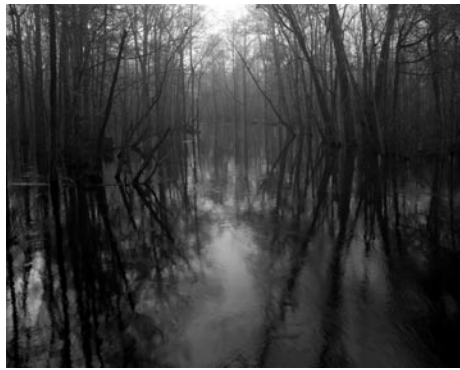
Work by Robert Cassanova

The process of photography provides context for isolating a portion of visual