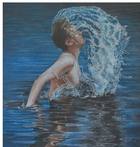
Work by Kate Lagaly

New Bern ArtWorks Fine Art Gallery in New Bern, NC, will present Explosion of Color , an exhibit of colored pencil paintings by The Colored Pencil Society of America, North Carolina District Chapter 114. The exhibit will be on view from Oct. 4 - 31, 2013.