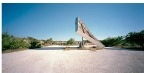
"US 90 (Pecos River)" by Lauren Greenwald, Archival Inkjet Print, 2015

The exhibition includes work Greenwald developed from her month-long solo road trip of more than 7,000 miles exploring the blue highways of the United States. Using a range of tools from pinhole cameras to digital video, she photographed scenic vistas, tourist spots, and miles of empty landscape from the roadside. By employing the still and the moving image, Greenwald records,