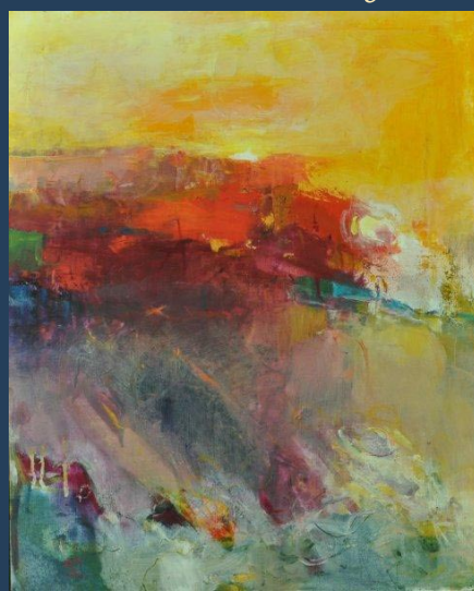
Beach Sunrise oil on canvas 23" x 18" www.LauraLiberatoreSzweda.com Contemporary Fine Art by appointment