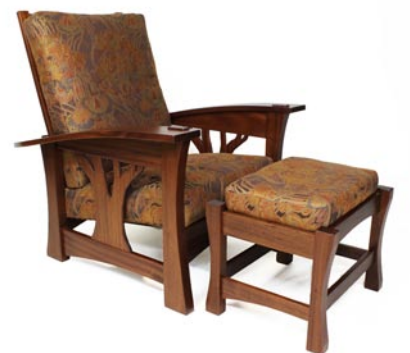
Work by Brian Brace

The Southern Highland Craft Guild, chartered in 1930, is today one of the strongest craft organizations in the country. The Guild currently represents nearly 900 craftspeople in 293 counties of 9 southeastern states. During the Depression the Guild cultivated commerce for craftspeople in the Appalachian region. This legacy continues today as the Guild plays a large role in the Southern Highlands craft economy through the operation of four craft shops and two annual craft expositions. Educational programming is another fundamental element of the organization, fulfilled through integrated educational craft demonstrations