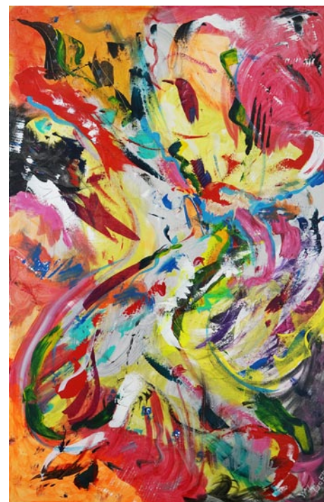
Work by W.P. "Wil" Goff

Sunset River Marketplace showcases work by approximately 150 North and South Carolina artists, and houses some 10,000 square feet of art work in virtually every genre. Custom framing, painting and