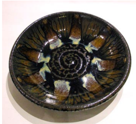
Work by Kim Ellington

Aesthetic Gallery , 6 College St., across from Pritchard Park, Asheville. Ongoing - Offering a variety of international works, including terracotta ceramics from Viet Nam and stone sculpture from Zimbabwe. In addition, there is an assortment of intricately detailed hand-crafted pictorial textiles from Australia and Lesotho, many of which depict local Asheville scenes. Also available are Australian Aboriginal oil paintings, Bruni Sablan oil paintings from the "Jazz Masters Series," and ceramic tiles from the Southwest (US). Hours: Tue-Sat, noon-6pm. Contact: 828/301-0391 or at ( www.aestheticgallery.com ).