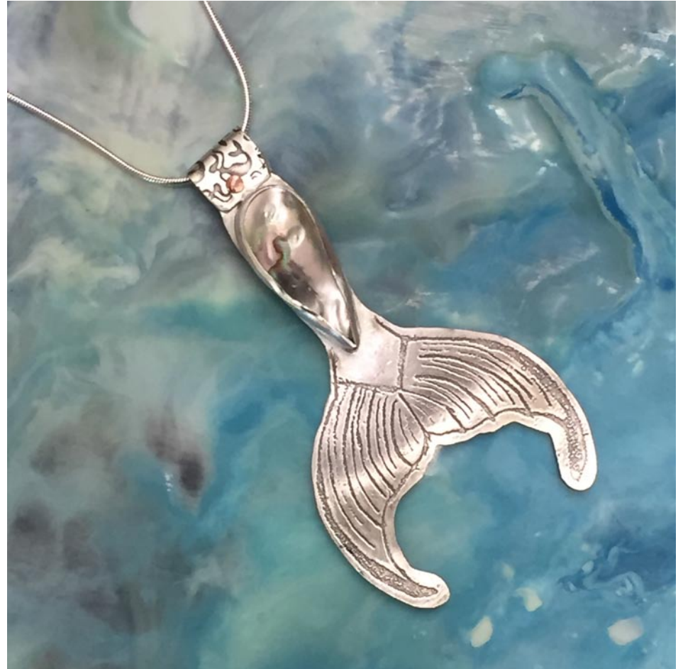
Work by Cheryl LeCroy

continued above on next column to the right