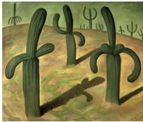
Diego Rivera, "Landscape with Cacti", 1931, oil on canvas, 49 3/8 x 59 in., The Jacques and Natasha Gelman Collection of 20th-Century Mexican Art, The Vergel Foundation, Conaculta/INBA, © 2018 Banco de México Diego Rivera Frida Kahlo Museums Trust, Mexico, D.F./Artists Rights Society (ARS), New York

The North Carolina Museum of Art's permanent collection spans more than