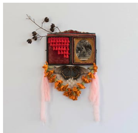
Work by Nina Garner

continued above on next column to the right