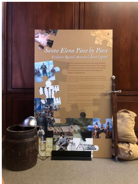
A image of items found in this exhibit.

Start your museum visit at the Discovery House to pick up a map of the property and information on our exhibits, walks, talks, tours, and more. Everyone is welcome. There is no admission charge, but voluntary donations are accepted. Our trail system which begins behind the museum, takes