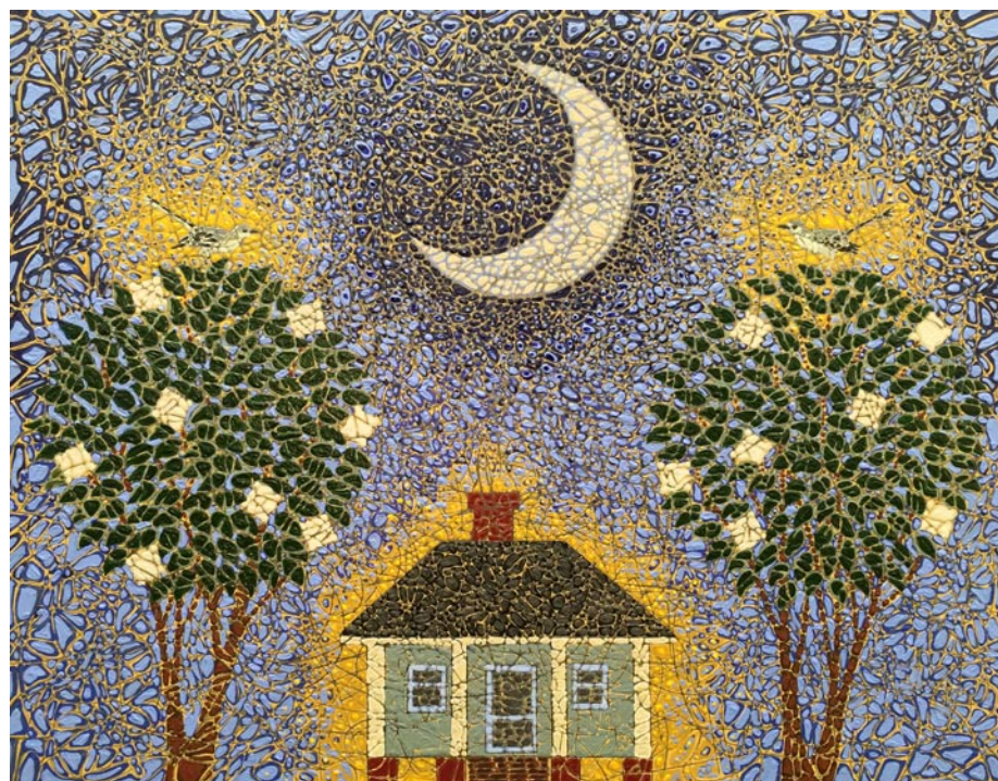
Night Birds, 2016, Acrylic, graphite, 11 x 14 inches