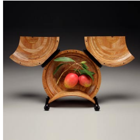
"It Takes Two to Mango" by Ray Jones and Jim Sams - Photo by Tim Barnwell

Southern Highland Craft Guild, Biltmore Village , 26 Lodge Street, former Biltmore Oteen Bank Building in Biltmore Village, Asheville. Ongoing - Featuring a wide range of work by members of the Southern Highland Craft Guild. including: pottery, glass, wood, jewelry, fiber, metal, paper, mixed media and natural materials. Hours: Mon.-Sat., 10am-7pm & Sun. noon-5pm. Contact: 828-277-6222 or at (www.craftguild.org).