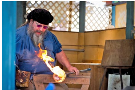
There's Artisan Glass Blowers

Test your skill at games like the Dragon Climbing Tower, the Archery Range, and the Maze. Take a ride on Christopher Columbus' Voyage to the New World, the Piccolo Pony (a rocking horse bigger than an elephant), and Leonardo's Flying Machine; a people powered amusement ride based on Di Vinci's designs for human flight. A family favorite is Mother and Father Goose brought to life with their costumed ducks and geese, the Petting Farm, and Camel rides.