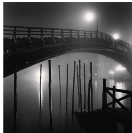
"Accademia Bridge, Venice, Italy 2007," © Michael Kenna

The Columbia Museum of Art is a charitable nonprofit organization dedicated to lifelong learning and community enrichment for all. Located in the heart of downtown Columbia, SC, the CMA ranks among the leading art institutions in the country and is distinguished by its innovative exhibitions and creative educational programs. At the heart of the CMA and its programs is its collection, which encompasses 7,000 works and spans 5,000 years of art history.