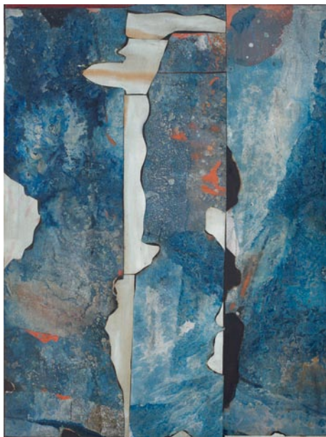
Romare Bearden, "River Mist", ca.1962, Oil on unprimed linen, and oil, casein, and colored pencil on canvas, cut, torn, and mounted on painted board, 54 x 40 in., © Romare Bearden Foundation / VAGA at Artists Rights Society (ARS), NY Courtesy of DC Moore Gallery, NY and American Federation of Arts

Romare Bearden was born in Charlotte, North Carolina, in 1911. In 1914, his parents relocated the family to Harlem as part of the "Great Migration," during which many southern-born African Americans fled north to escape the Jim Crow South. Bearden began his training in the 1930s, studying art alternately at