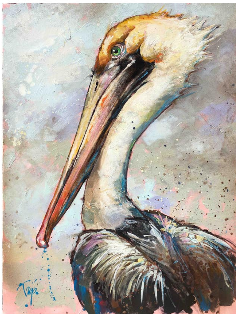
TRIP PARK, SHY PELICAN, 30x40, MIXED MEDIA