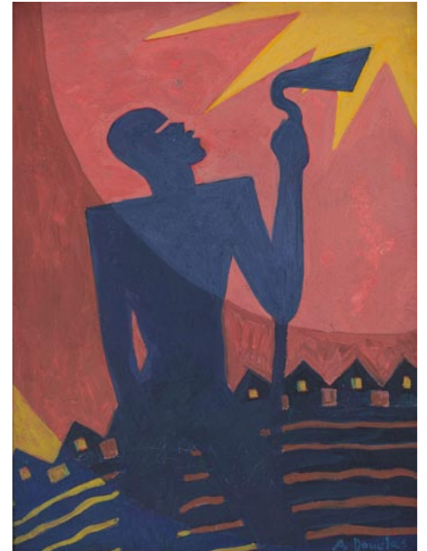
"The Toiler" by Aaron Douglas