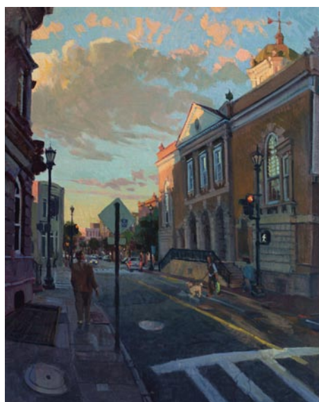
Work by West Fraser

West Fraser is known for his classic views of the Lowcountry ranging from marsh vistas to coastal jungle. His extraordinary use of light and color to capture the glow of an early morning on the water to the dappled light and reflections along the streets of Charleston has been revered for decades. The simple meandering of a creek through lush fall marshes is elevated