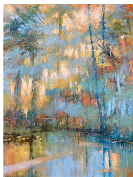
Work by Monique Carr

The style that emerges in Carr's work is out of the ordinary. It bursts with energy with its vibrant colors, constant movement and intriguing texture. She likes to experiment, try different mediums, substrates and embraces the new discoveries. Also, you