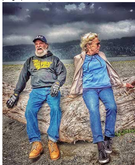
Work by Eric Raddatz

Supergraphic , 601 Ramseur Street, Durham. Ongoing - Supergraphic is a creative art studio dedicated to providing work space, equipment and instruction for the production of fine art prints and print media. Hours: open by appointment and during Third Friday art walks. Contact: 919/360-4077 or at ( http://durhamsupergraphic.com/ ).