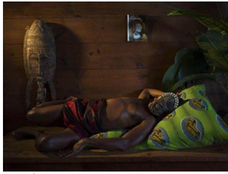
Lyle Ashton Harris, "Afropunk Odalisque", 2018. Dye sublimation print on aluminum. Edition AP1.