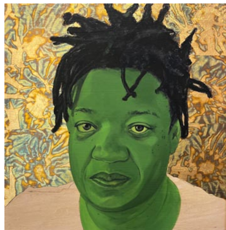
Work by Clarence Heyward

Brookgreen Gardens in Murrells Inlet, SC, is presenting The National Sculpture Society's 90th Annual Awards Exhibition , on view in the Rosen Galleries, through Oct. 22, 2023. Brookgreen, home to the largest and most significant collection of American figurative sculpture in the world, will be the premiere location of this exceptional annual exhibition. The National Sculpture Society (NSS) is the country's first organization of professional sculptors and handpicks pieces for this exhibition, presenting the finest in contemporary figurative sculpture by American masters alongside rising stars. "We are thrilled to premiere this annual exhibition on its 90th anniversary as we continue our mission to collect and display the finest American sculpture and continue our longstanding relationship with the NSS since our founders, the Huntingtons, were members and supporters of the organization," says Page Kiniry, President and CEO of Brookgreen. "We hope visitors will take this opportunity to enjoy extraordinary works from some of the country's best contemporary sculptors displayed in this year's exhibition." For further information call the Gardens at 843-235-6000 or visit ( www.brookgreen.org ).