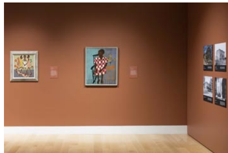
View of the exhibit "Kindred Spirit: The Personal Worlds of William H. Johnson (1901-1970), on loan from Morgan State University.