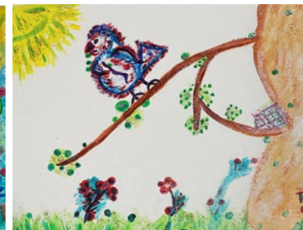
Ellie's Apple Tree and Bird