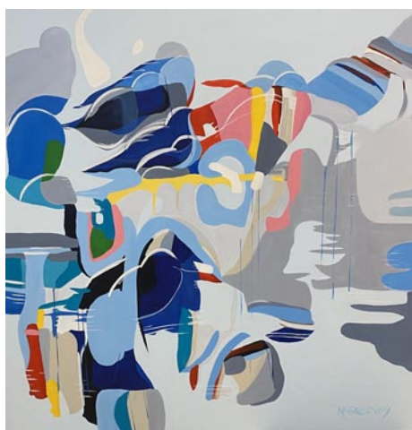
Work by Pat McGreevey

McGreevey's work, characterized by vibrant color combinations, contrasting shapes, and deep dimensions, depicts the world through a lovingly fragmented lens that conveys sheer energy and emotion. "I want to create art that people love. Art that is thought provoking and emotionally evocative. Art is one of life's luxuries that moves us in a myriad of emotional directions, and we want it around us to continue..."