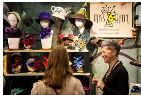
View from a previous Fair

For more information about the Sanford Brush & Palette Club, to register as a new member, stay up to date on Annual Art Show events, or to become an Art Show sponsor, please visit ( www.sanfordarts.org ).