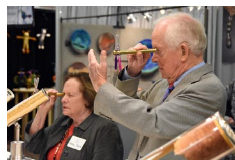
View from a previous Fair

Piedmont Craftsmen will celebrate the 61st Annual Piedmont Craftsmen's Fair at the Benton Convention Center in downtown Winston-Salem on Nov. 23 and 24, 2024. The organization continues its anniversary celebration marking 60 years of its existence. Piedmont Craftsmen has attracted artisans who are masters of their craft, producing work that is distinctive and innovative since its founding in 1963. The Fair showcases the handwork of 100 artists from across the United States, working in clay, wood, glass, fiber, photography, print-making, and mixed media.