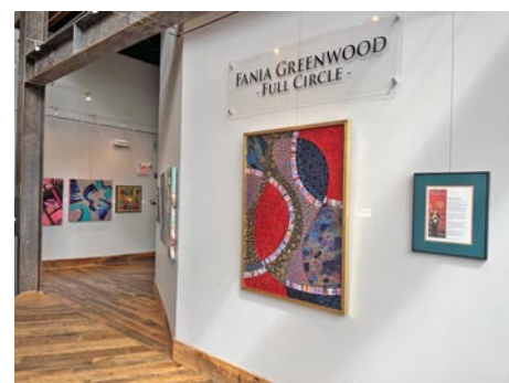
View of the "Full Circle" exhibit

fields for nearly 35 years while raising her three children. Seven years ago, she started painting but her work has been inspired by my many experiences from the last 60 years.