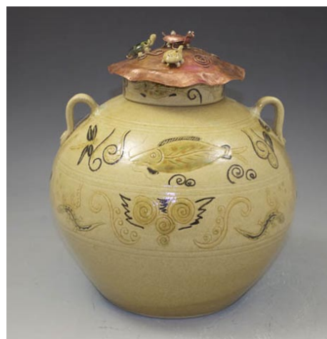
Collaborative piece from Jugtown Pottery and JLK Jewelry for the Friday night Gala auction.

warmly welcoming them to spend a leisurely time browsing and shopping, seeing the process, developing and renewing relationships with the potters of Seagrove. This would not be possible without the immense dedication of our volunteers, including members from the Asheboro City Council, The Randolph Arts Guild, auctioneers, educators, pottery lovers and collectors. We are always looking for ways to build on this essential team. Volunteers have the opportunity to work on many aspects of the festival, including the auctions, artist relations, gala preview event, production, special projects