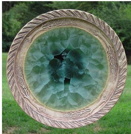
The McCandless-Mahan piece up close

Last year's event was another resounding success, drawing over 400 people to the Friday evening Gala and over 5,000 folks from NC and multiple states to the unique festival weekend. Each year the event has generated a total measurable financial impact of over $485,000.