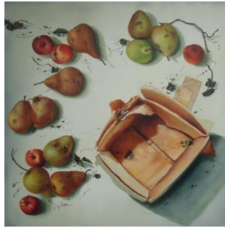
Out of the Box by Wanda Steppe

Wanda Steppe says, "I have amassed a considerable collection of objects that hold personal meaning for me, everything from birds' nests and eggs to dead flowers and insects. They have one thing in common; all are a testament to what once was— elegant, haunting reminders of life at