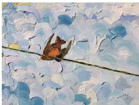
Work by Lese Corrigan

The show is a series of new works fleshing out a piece done in 2004. It references a series called "Space Between" painted in the same year about the space between objects - what physicists had previously called empty space but now know is filled with many "things." This new series continues the exploration of birds on telephone wires - those "simple" shapes we see up above us on diagonals cutting the space of the sky in