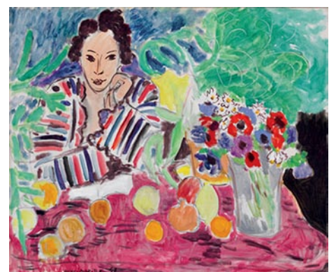
Henri Matisse, Striped Robe, Fruit, and Anemones , 1940. Oil on canvas, 21 5/8 x 25 5/8 inches (54.9 x 65.1 cm). The Baltimore Museum of Art: The Cone Collection, formed by Dr. Claribel Cone and Miss Etta Cone of Baltimore, Maryland, BMA 1950.263. © 2012 Succession H. Matisse / Artists Rights Society (ARS), New York.

In addition to modern masterpieces, the exhibition includes textiles and decorative arts from Europe, Asia and Africa that the Cones collected, as well as photographs and archival materials to highlight the remarkable lives of these sisters. Also featured in the exhibition will be an interactive virtual tour of their adjoining Baltimore apart-