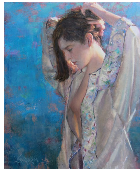
Work by Bart Lindstrom

Commercial Gallery listings, call the gallery at 828/817-3783 or visit ( www.skyukafineart.com ).