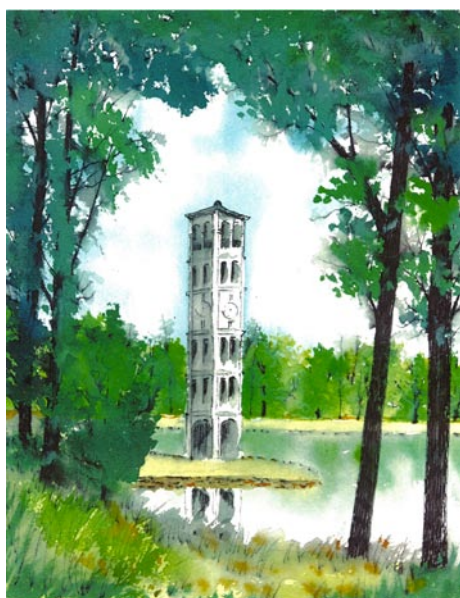
Work by Pat Grills

The Artists Guild Gallery of Greenville is a co-operative gallery located in Page 6 - Carolina Arts, November 2012