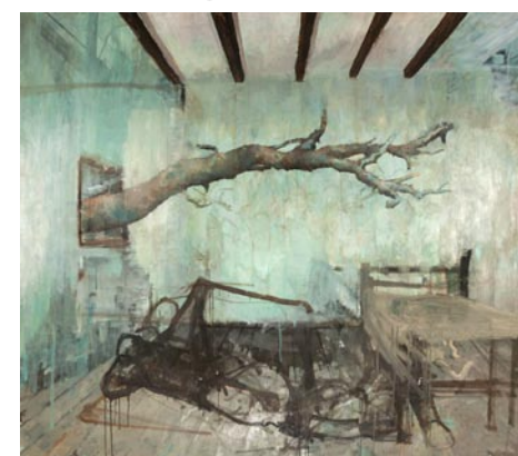
Work by Santiago Quesnel

Disruption joins five sets of works also on view, further reinforcing LaCa's representation of a wide-ranging and dynamic