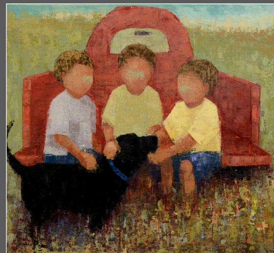
Rebecca Kinkead Tailgate No. 29 46 x 50 inches

Opening Reception Friday November 15, 2013 6 - 8:30pm