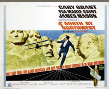
North by Northwest (1959) November 2 at 3pm, admission free