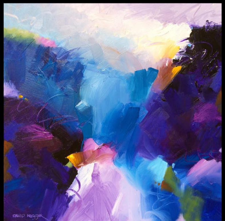
Tidal Shift 3, 36x36 Acrylic on Canvas