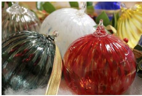
Glass Ornaments by STARworks Glass

held from 9am to 5pm, Nov. 22 & 23 at Seagrove Elementary School, located at 528 Old Plank Road. The event will feature pottery and traditional craft booths. There will be an auction of signed and dated pottery, demonstrations and food vendors. Admission is $5, and children 12 and younger get in free. The Festival is hosted by the Museum on NC Traditional Pottery. For more information, visit the museum or contact Bobbie Brewer at 336/873-7887.