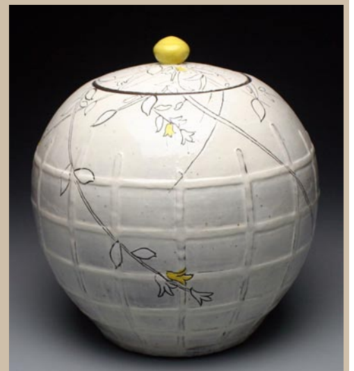
Work by Ben Carter

If you like what you hear you might want to sign up for the newsletter. To join the list click the following link and sign up in the box below the streaming player: ( http://www.carterpottery.blogspot.com/2009/05/welcome-to-tales-of-red-clay-rambler.html ).