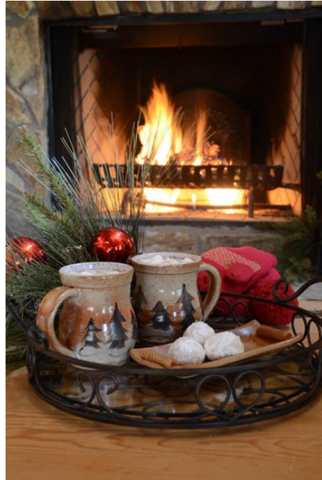
Works from Thomas Pottery