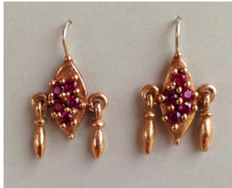
Works by Stacey Lane

For further information check our NC Commercial Gallery listings, call the gallery at 828/688-6422 or visit ( www.micagalerync.com ).