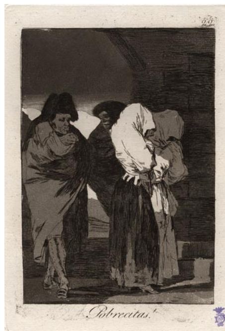
Plate #22, by Francisco de Goya, "Poor little girls!", 216 mm x 149 mm (8 1/2 x 15/16 in.) H. 57.

Jones-Carter Gallery , of the Community Museum Society Inc, 105 Henry Street, next to The Bean Market, Lake City. Through Jan. 3, 2015 - "Francisco de Goya's Los Caprichos," an exhibition of etchings, one of the most influential graphic series in the history of Western art. This exhibition features a superb first edition of the complete set of 80 etchings, which by tradition was one of the four sets acquired directly from Goya in 1799 by the duke of Osuna. It then came into the hands of Pedro Fernández Durán, of the house of the marquis of Perales, the greatest Spanish collector of the 19th century and a major donor to the Prado. His collector's mark appears on all 80 prints of this set. The exhibition includes an essay contributed by Robert Flynn Johnson, Curator in Charge, Achenbach Foundation for Graphic Arts, Fine Arts Museums of San Francisco. Other works by Goya are also included in the exhibition for instructive comparison including a few later edition prints from "Los Caprichos" and examples from each of Goya's other major graphic series: "Los Desastres de la Guerra", "Los Proverbios", "La Tauromaquia"; and his early etchings after "Velasquez". Hours: Tue.-Fri., 10am-6pm & Sat., 11am-5pm. Contact: call 843-374-1505 or at ( www.jonescartergallery.com ).