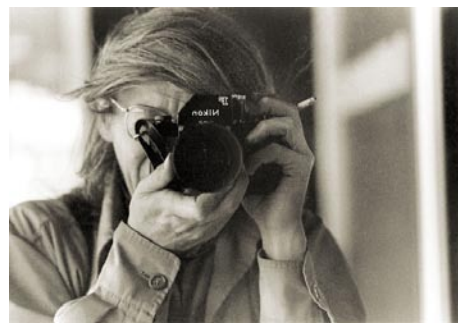
Work by John Menapace

Collective Arts Gallery & Ceramic Supply , 8801 Leadmine Road, Suite 103, Raleigh. Ongoing - Featuring works by local and nationally renowned artists on permanent exhibit. Hours: Tue.-Fri. 11am-7pm & Sat., 10am-6pm. Contact: 919/844-0765.