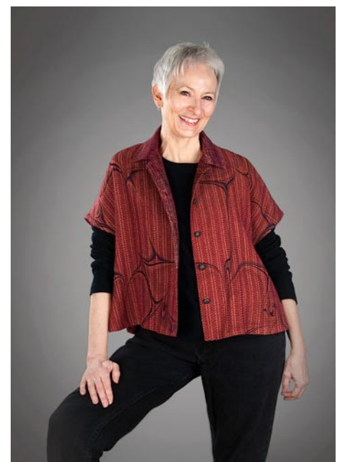
Work by Liz Spear

Liz Spear makes one-of-a-kind, comfortable garments with her own handwoven cloth: shirts and jackets designed to wear to the office or with your favorite pair of jeans. Her fabrics begin with twelve cones of cotton and rayon yarns, inspired by the colors