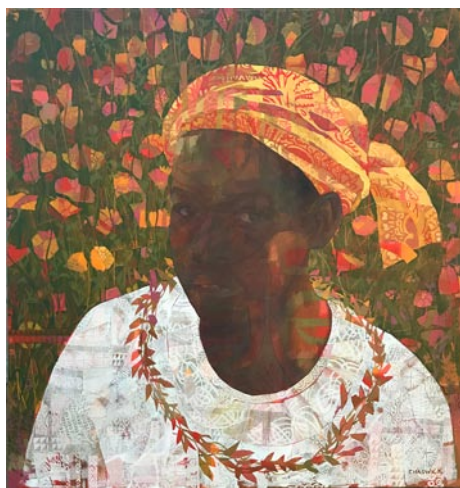
Work by Kevin Chadwick

Chadwick now works out of the historic city of Lynchburg, VA, painting full time. His portraits and figurative works can now be found in the collections of the Caring