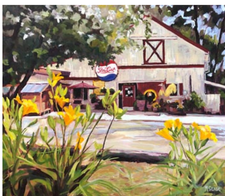
Work by Murray Sease

In addition to this show Sease's latest paintings can be seen at La Petite Gallerie on Calhoun Street in Bluffton, SC, which