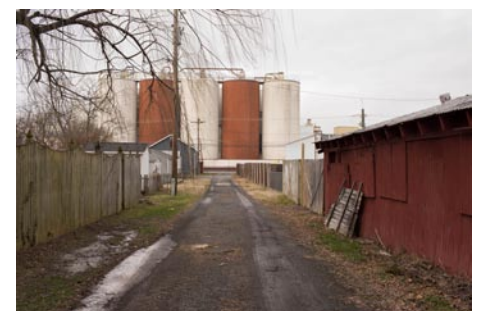
Work by Ed Wordeck

Corrigan Gallery represents Charleston contemporary artists, artists of the Charleston Renaissance and second market pieces of significance. A sampling of the works can