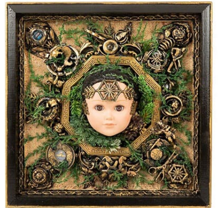
Work by JoAnn Borovicka, part of the "12 x 12" exhibition

For further information check our SC Institutional Gallery listings or visit ( https://www.greenvillearts.com/ ).