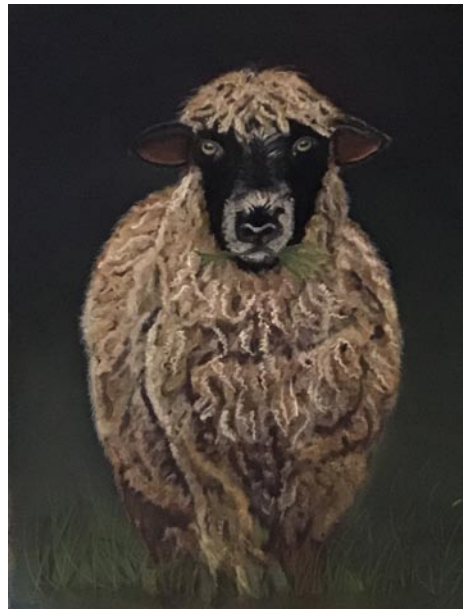
Work by Susan Lovett

Now an annual tradition, Critters gives the community a chance to view and purchase art about the creatures we love and cherish. Critters celebrates all creatures that walk, wiggle, fly, swim or slither. The exhibition highlights local artists' depictions of animals of all sorts, in mediums ranging from photography to painting, and sculpture to ceramics.