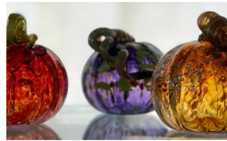
Works from Conway Glass

We are sad that we won't be teaching classes this year. We plan for 2021 glassblowing classes to begin in February. Of course, this depends on your safety. We are optimistic. Next week we'll light up the furnace (a little late this year), and we will jump into a few months of glassblowing. We'll make glass pumpkins and ornaments of every color. The studio will remain closed to the public, but we are creating and the furnace work is a welcome respite for us.