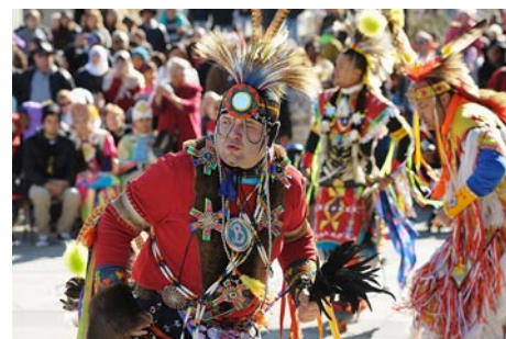
Image from previous American Indian Heritage Celebration

To ensure the safety of our guests, staff, and presenters, this year's annual festival will be held entirely online. However, that does not mean the interactive activities have stopped! Engage with live-streamed events that include performances, panel discussions, and demonstrations from the safety and comfort of your home or classroom. Watch on-demand videos any time. A special celebratory video to mark the museum's 25th anniversary of this community event is also available.