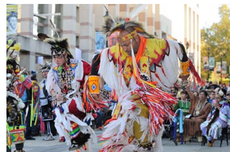
Image from previous American Indian Heritage Celebration

*Learn languages spoken by American Indians in North Carolina, including Tutelo-Saponi and Cherokee.