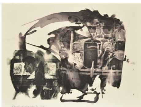
Robert Rauschenberg, "John" from the "Ruminations" series, 1999, photogravure on paper, edition 3/46, publisher: Universal Limited Art Editions, Bay Shore, NY, 29 1/2 x 38 7/8 inches. Asheville Art Museum. © Robert Rauschenberg Foundation / VAGA at Artists Rights Society (ARS), New York.

Also presented in the exhibition is an important series of prints by Judy Chicago (born Chicago, IL 1939). Five decades into her career, Chicago stands as one of the foremost artists of the 20th and 21st centuries, having committed to socially