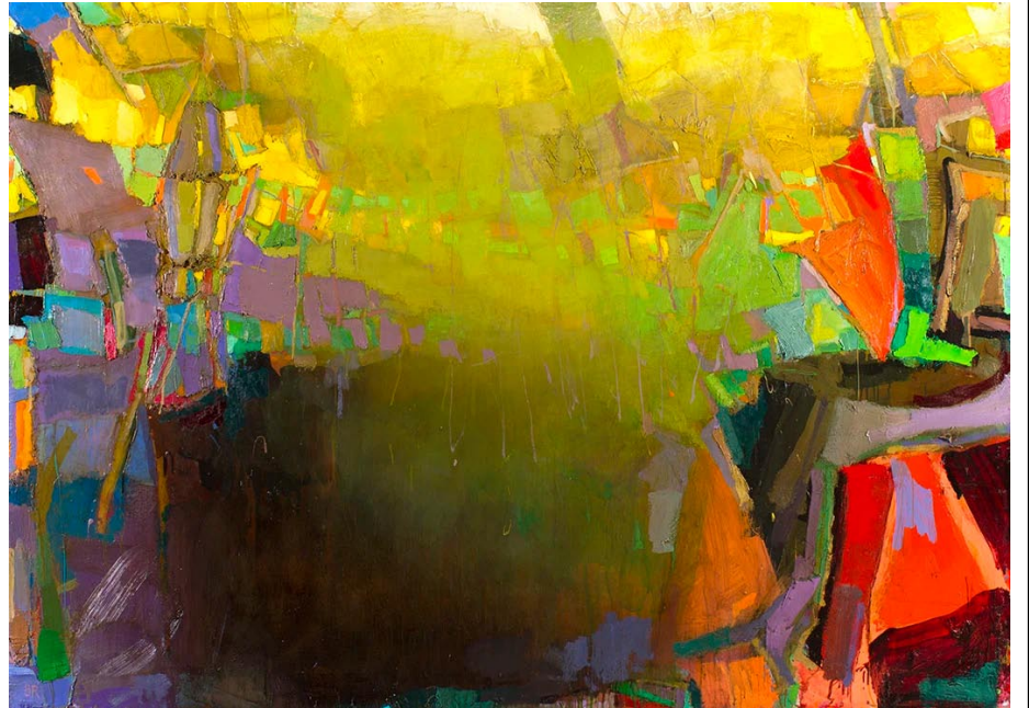
French Landscape 2, 2010, Oil on linen, 56 x 79 inches