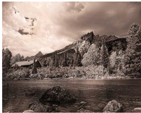
Work by Jeff Sherman

For further information check our NC Institutional Gallery listings, call the Council at 252/638-2577 or visit ( www.cravenarts.org ).