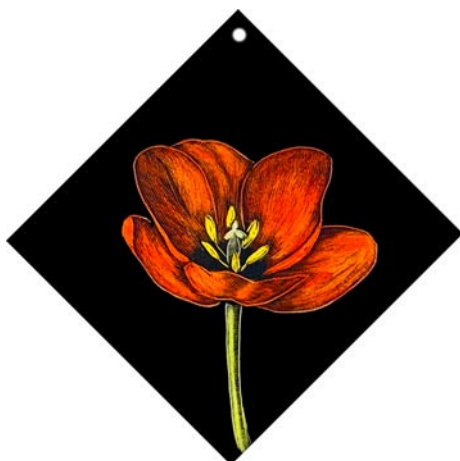
Work by Chris Graebner

Fiber art on display includes framed fabric collages and hand dyed stitched cloth. The jewelry in the show covers a variety of styles and techniques, from copper and bronze to sterling and fine silver necklaces, earrings, bracelets and rings, some with gold accents and stones. Visitors will also find metal sculpture, figurative sculpture, pottery, and hand-made furniture. Fine art photography, oil and acrylic painting, scratchboard, and mixed media work festively surround the three dimensional pieces on pedestals.