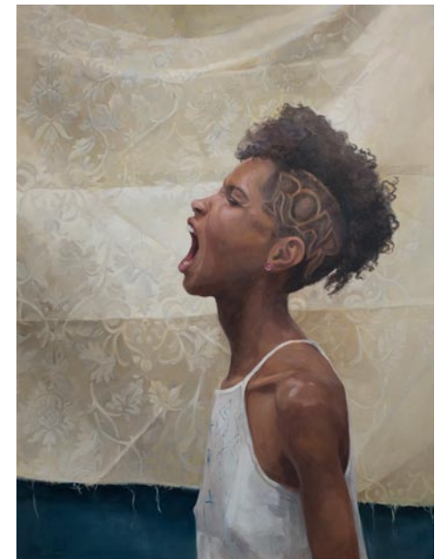
Work by Alia El Bermami

African American Atelier & Bennett College for Women Gallery , Greensboro Cultural Center, 200 N. Davie Street, Greensboro. Ongoing - Featuring works by local, regional and national African American artists. Hours: Tue.-Sat., 10am-5pm; Wed., till 7pm & Sun., 2-5pm. Contact: 336/333-6885.