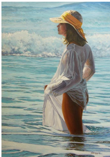
Work by Gary Gowans

The high realism in Gowans' figures, still lifes and some landscapes is attention grabbing in its detail, while other works are more expressionistic, full of energy and bold, broken brushstrokes. This alternation of both style and subject is what keep his work fresh and always new. The artist continues, "I make an effort never to copy myself," stating that each piece is a learning