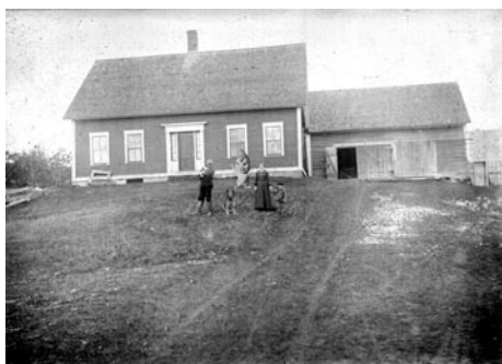
Work by Robin Childers

In this exhibit, Childers will be showcasing select digital and silk screen prints she has created over the past few years. The art will focus on photographic images that she has collected of various subject matters, some of which relate to the textile industry.