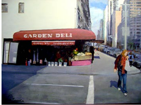
Work by Akira Tanaka

For further information check our NC Commercial Gallery listings, call the gallery at 704/333-4535 or visit ( www.providencegallery.net ).