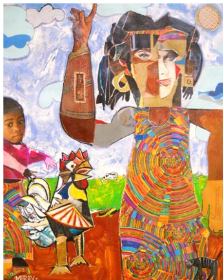
Work by Eric McRay

in 1913. Reality displaced realism as an artistic concern and throughout the twentieth century; the camera, the automobile and the mushrooming urban experience amongst other things shaped reality. With assemblage, odd found objects, even junk, from chewing gum to cuckoo clocks, are collected and fabricated into sculpture to express ideas and possibilities from deeply meaningful to comical.